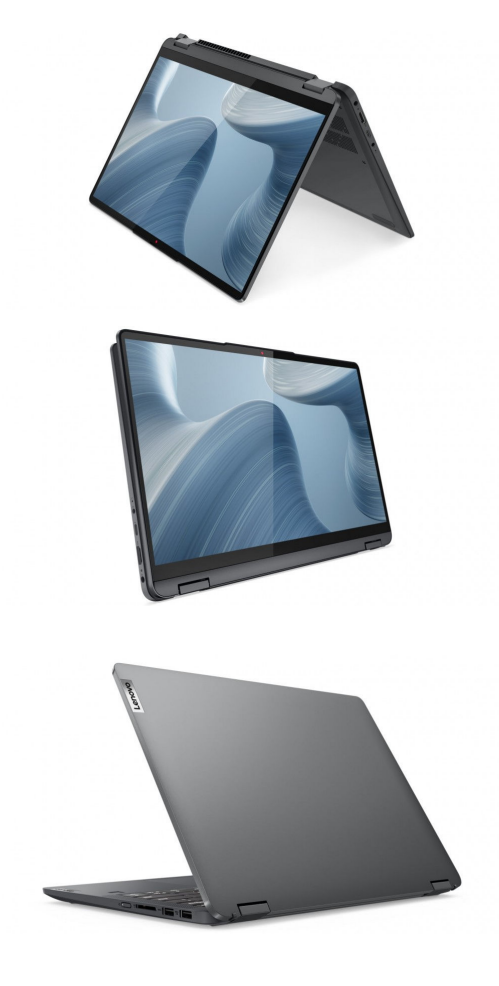
Customise with Top Vinyl &